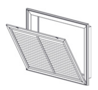
A - Hinge Standard