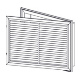
C - Hinge