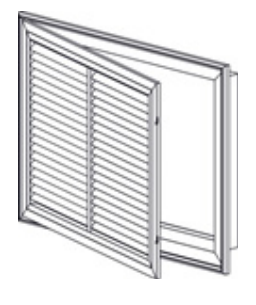
D - Hinge