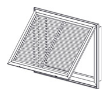
B - Hinge