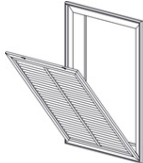
H - Hinge