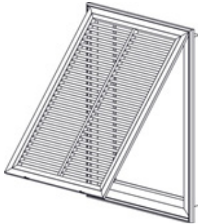
G - Hinge